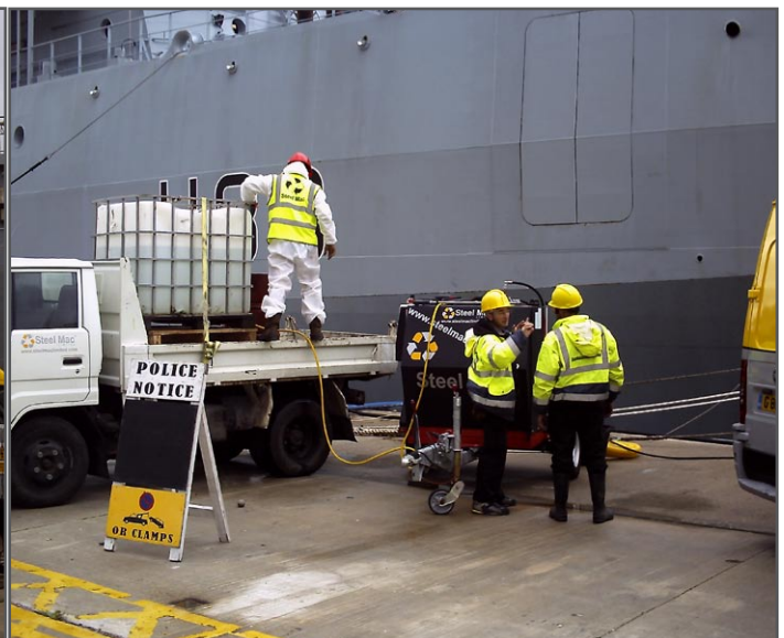
(above left-clockwise) The SteelMac crew use breathing apparatus, waste water is pumped out onto cubitainers.