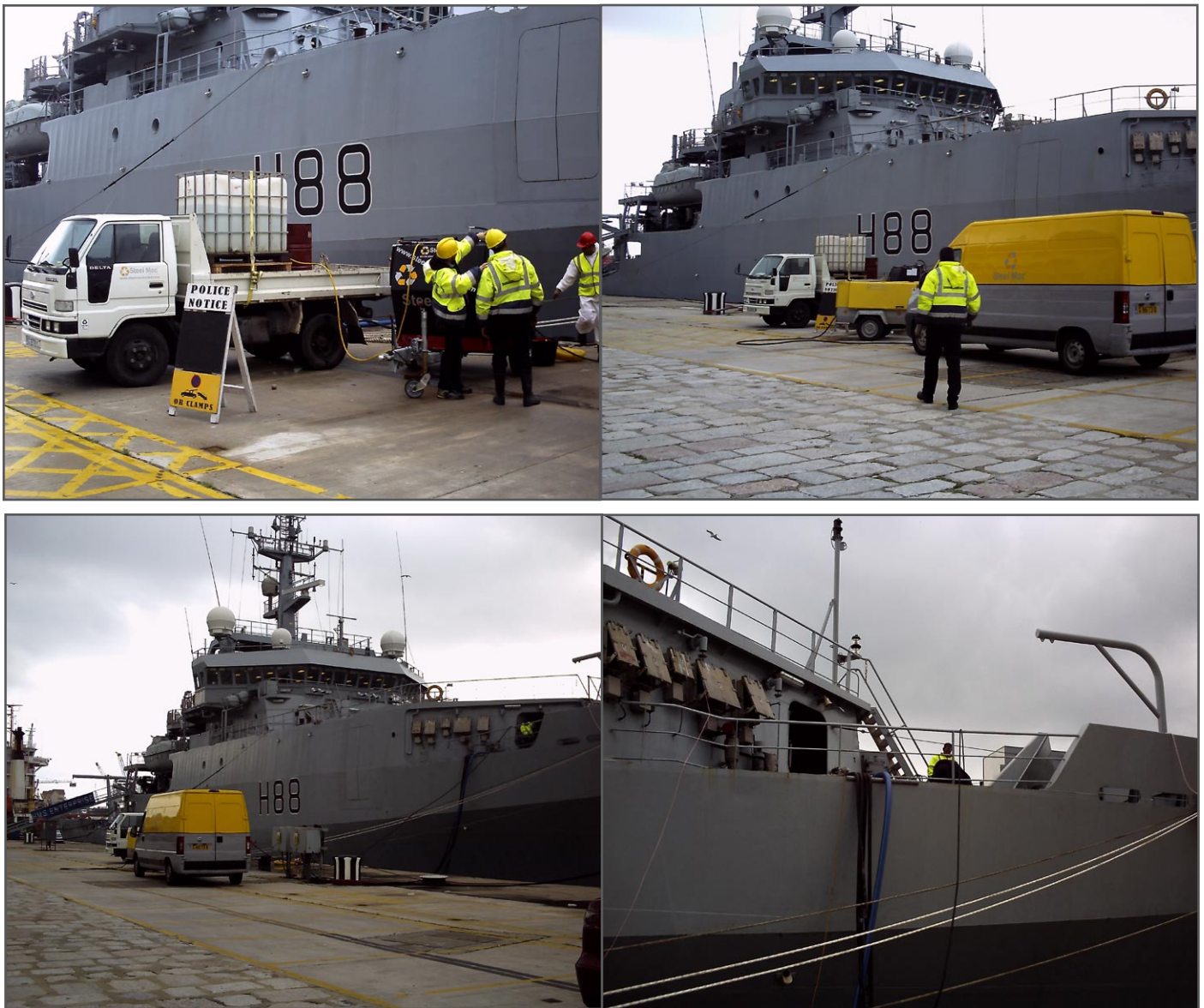
(above) The SteelMac operation runs smoothly as the waste water is transported away from the HMS Enterprise

For further information please do not hesitate to contact the SteelMac head office: